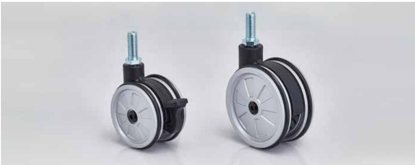
CMF60BB-2SV-T14 (with brake)