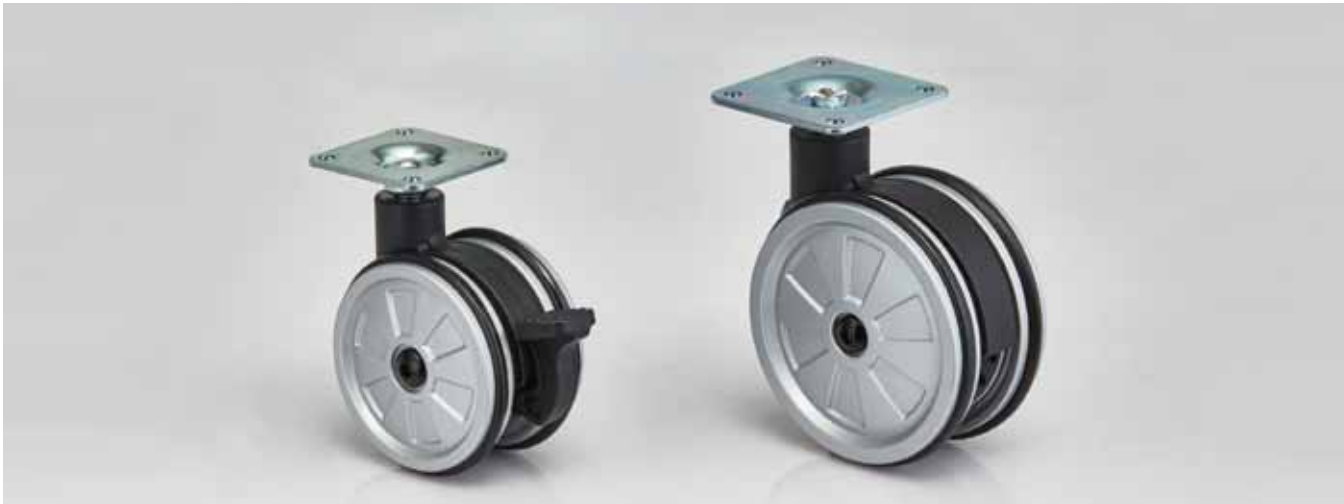
CMF60BB-2SV-PT42 (with brake)